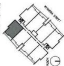
PLAN KEY - TOWER